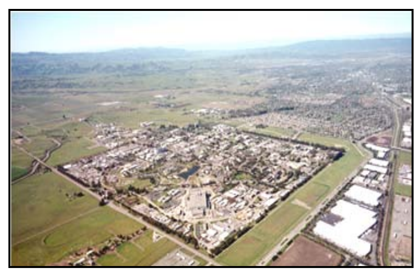
Figure 2-1. Aerial view of LLNL main site (LLNL 2005a).

populated 1.5-mi<sup>2</sup> area in Livermore, California (Figure 2-1), and the 11-mi<sup>2</sup> Explosive Test Site near Tracy, California, which is also known as Site 300.