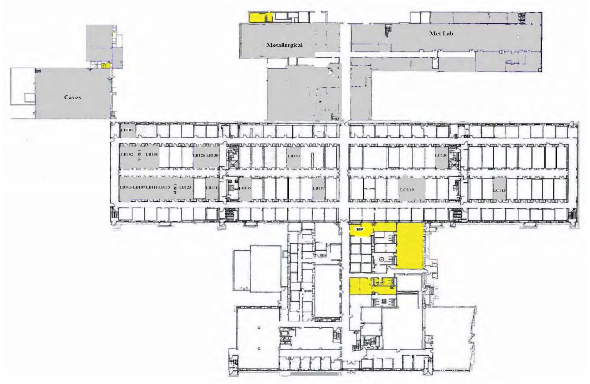
Figure 7-2: Building 773-A Thorium Operations Locations